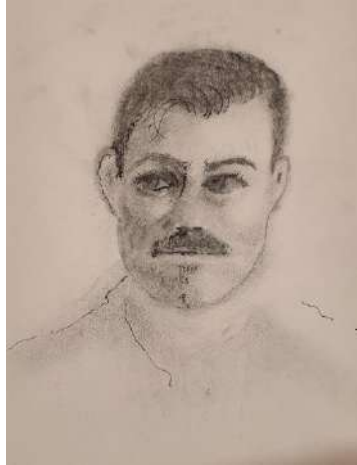
Pen and smudge