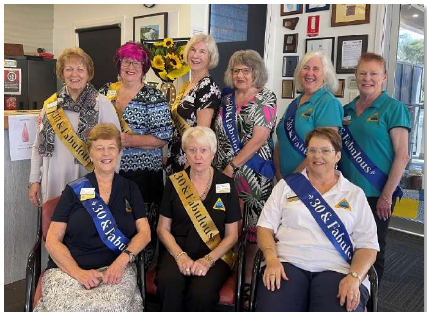
Foster / Tuncurry U3A Committee wearing "30 and Fabulous" sashes.